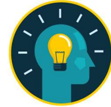
Leadership & Organizational Development