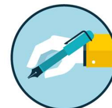
Osher Lifelong Learning Institute