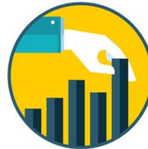
Regional Economic Studies Institute (RESI)