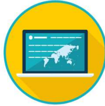
Cloud Services & IT Consulting