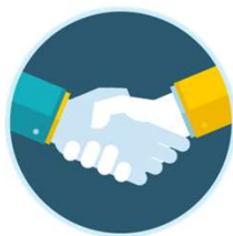
Partnerships & Outreach