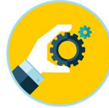
Continuing & Professional Studies