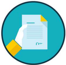
Office of Administration & Finance