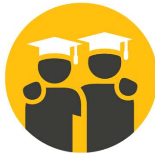
Focus on Student Success