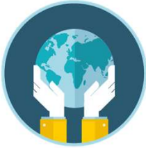
Center for GIS (CGIS)