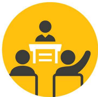
Corporate Customized Training